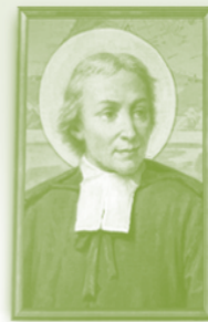
St. John Baptist De La Salle. (Founder of Lasallian Schools)

We have now finalised the hours of our school day. Please see below for the timing of the day for the High School, Elementary School and Nursery Reception classes.