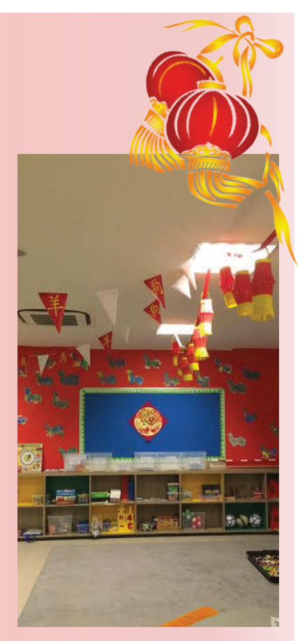
I during my chinese new year I made a lantern. On my chinese new year I sawalion drace in sije on my chinese new year I did a ink pointing and that link pointing a chinese Stor.

"We have had great fun celebrating Chinese New Year with the children today at school. They all looked fantastic in their traditional costumes and we loved seeing all the colours. The children did lots of art activities which really made the classroom come to life"