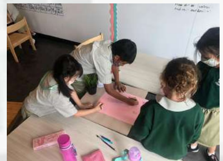
Creating posters about their learning