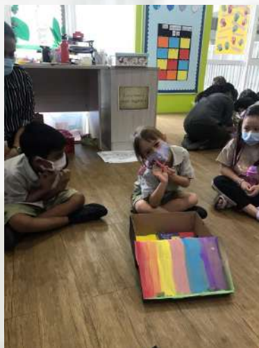
Sharing their 'Marvellous Me' boxes