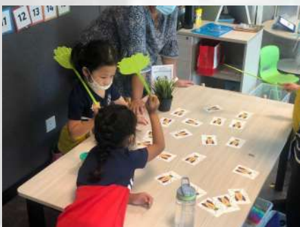
Practising tricky words