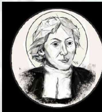
The Founder and the Lasallian Core Values