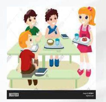
October Menu Term 1 2020 meal charges

Whole School Teaching Staff Email 2020/21