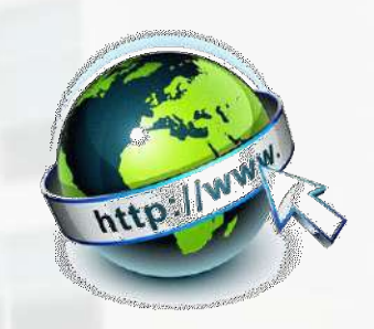
Epurse (Top up credit) Tapestry (For ES) Parent portal (For ES)