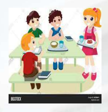
Term 2 AY 20/21 meal charges ES Menu_Jan 2021 HS Menu_Jan 2021