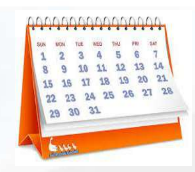
HS Parent Calendar 2020/21 ES Parent calendar 2020/21