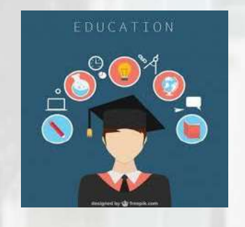
University & Careers Counsellor (TBA)