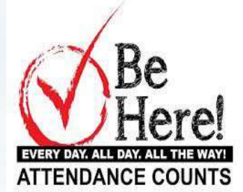
ES Student Absence Form HS Student Absence Form