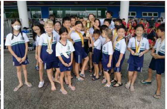
Under 9 Boys Champions Under 11 Boys Champions 20 Gold, 18 Silver, 14 Bronze Medals