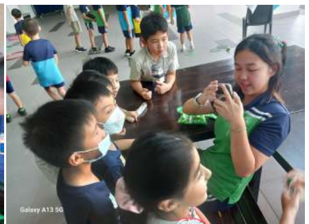
Galaxy A13 5G