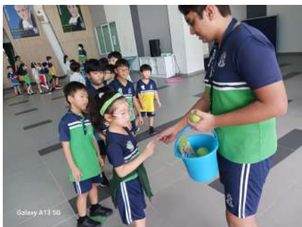
Galaxy A13 5G