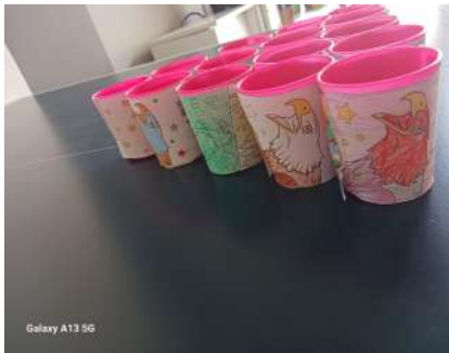
Galaxy A13 5G